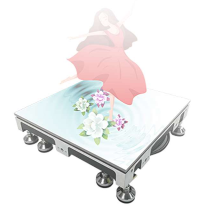
Floor LED Display Built in interactive sensor